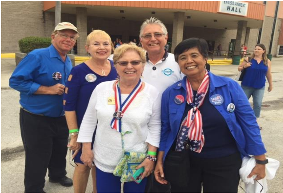
Some of our members at the Clinton Rally in Tampa!